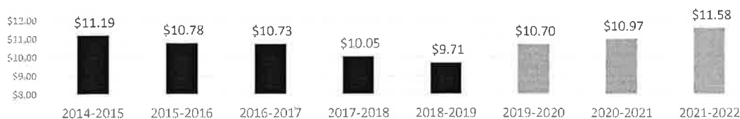
River Valley Mill Rate

→ A tax calculator is located on our website at: https://www.rvschools.org/district/referendum.cfm